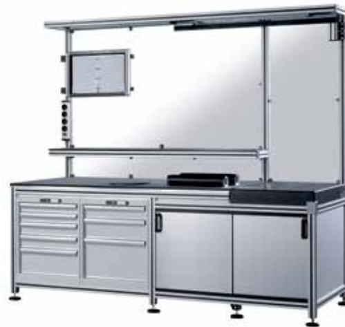
Measuring station with integrated granite desktop and turntable